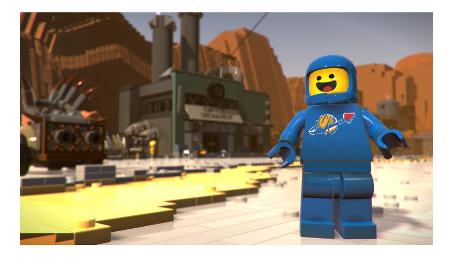
The LEGO Movie 2 Videogame Ativador Download [Password]

Download ->>> <a href="http://bit.ly/2NHDIW2">http://bit.ly/2NHDIW2</a>